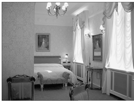
One of the 29 rooms in the Yeliseyev Palas, which will expand to 100 rooms by 2006.